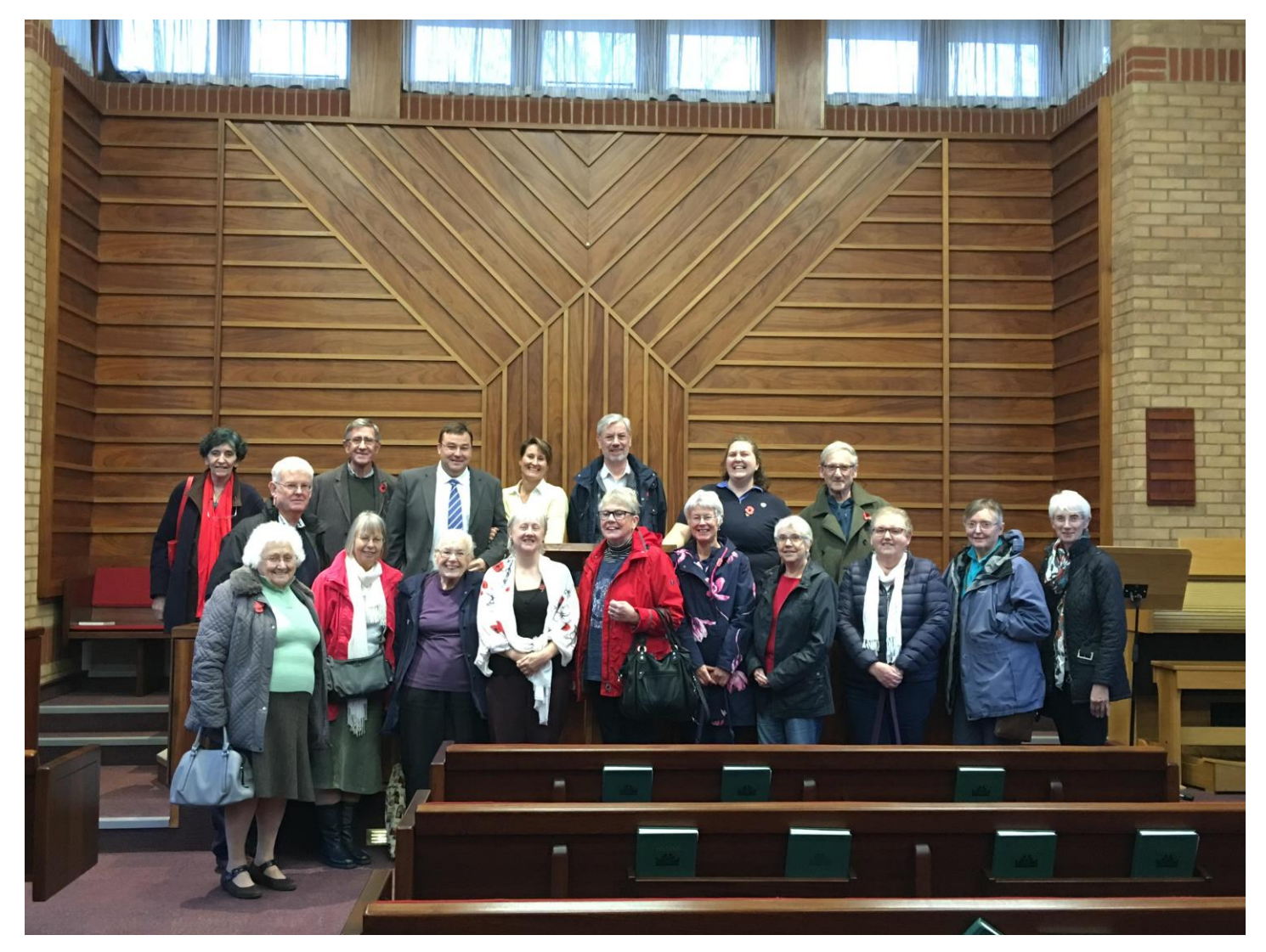
Photo shows members at the Church of the Latter Day Saints, Two Mile Ash.

Please contact Linda Morris via <a href="mailto:ewf@mku3a.org.uk">ewf@mku3a.org.uk</a> if you are interested in attending.